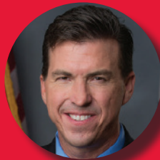
Assemblymember Kevin Mulin, CA State Assembly District 22